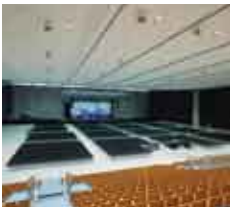
Stadthalle Graz Town Hall, Austria 2002