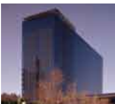
Sheraton Arabella Hotel, Cape Town, South Africa 2003

Architects: Peter Cook & Paul Fournier, London