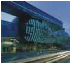
Kunsthaus Graz Entertainment Facility, Austria 2003