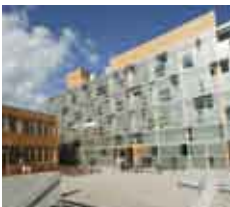
The Cube Hotel, Austria 2004